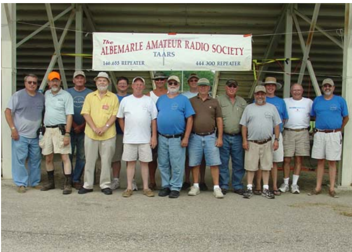
TAARS 2009 FD Group (after lunch just before time to start operating)