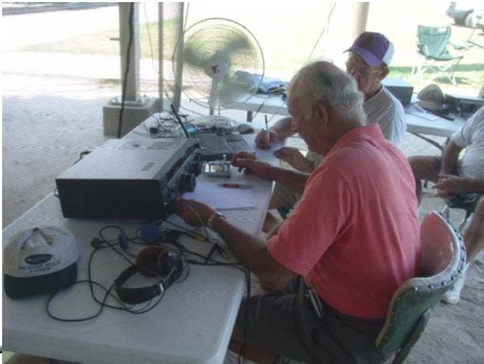
Crank up that key. Long live CW.