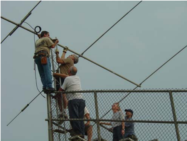
What a crew!