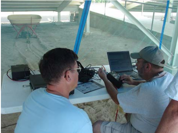
Getting ready; checking antennas