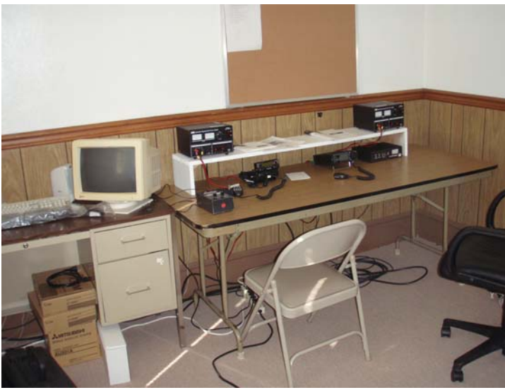
Operating positions with deluxe furniture