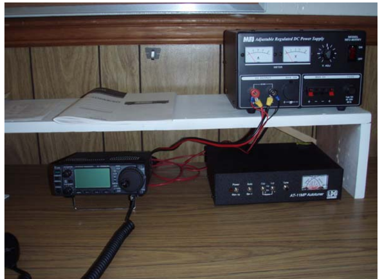
‘706 with LDG tuner