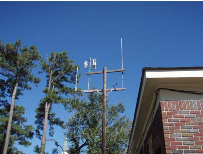
Our antenna farm